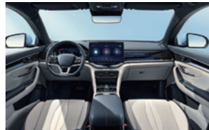
Blue and grey